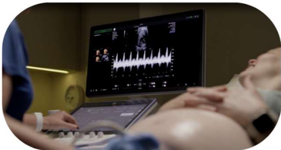
Premium ultrasound systems